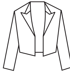
Eton —men's squared front bolero with peak lapel. Choice of embroidery, braid, or added decoration. COS-M-ET-02