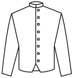
Eton —men's & women's 7-8 button single breasted. Stand-up collar. ETO-W/M-06