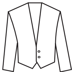
Eton —men's & women's 2 button single breasted cardigan. ETO-W/M-07